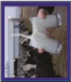
Tentative Camp Schedule